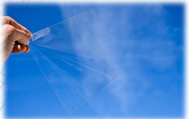
TranDuctive® layer coated on PET

For more information on our conductive inks, please contact: